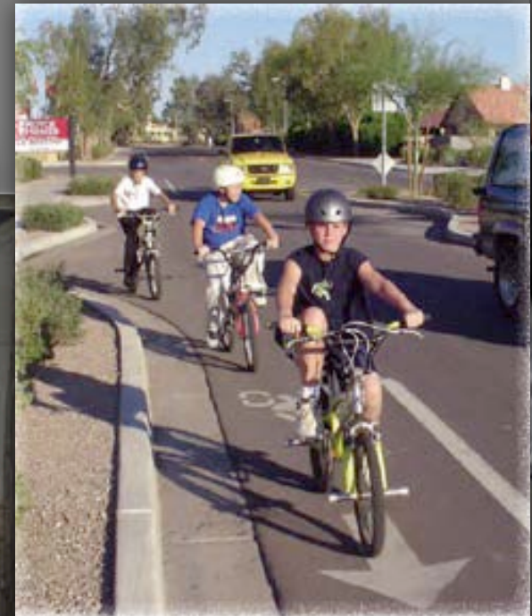
Children riding bikes to school via bike lane.